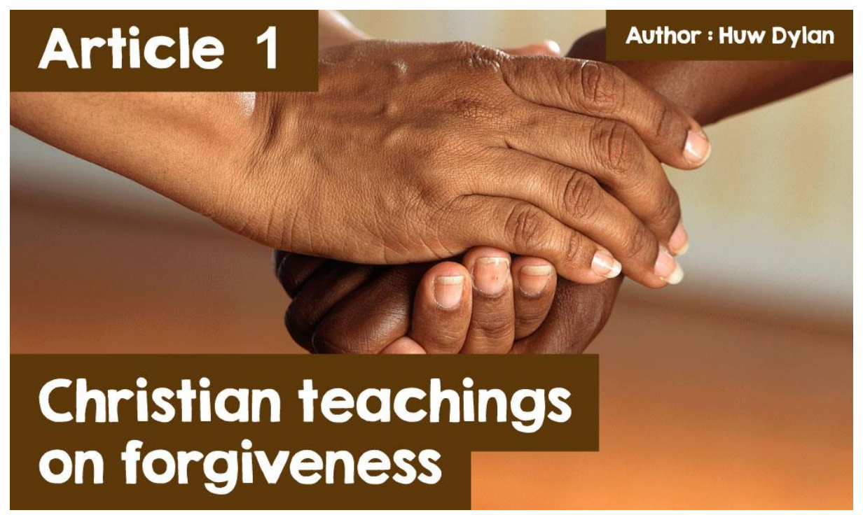
'I forgive you'

How easy is it to say those words? How easy is it to forgive someone? Many people would say that it is one of the most difficult things to do in life, especially if the other person has seriously hurt you, either physically or emotionally. What exactly does forgiving someone mean? Well, if you looked in a dictionary for a definition of forgiveness you would probably see something like this - 'a conscious, deliberate decision to release feelings of anger or revenge towards a person or group that has harmed you, whether they deserve your forgiveness or not. 'You have probably heard the English saying - 'forgive and forget' and many would argue that it is not possible to truly forgive unless you forget the transgression or wrong the person has committed against you and start the relationship over again. That of course is what makes forgiveness so difficult to achieve. Can you forgive without forgetting, or does remembering the offence mean that you still keep some desire for revenge in the back of your mind? What do you think?