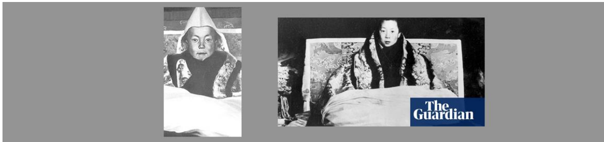
Dalai Lama Images