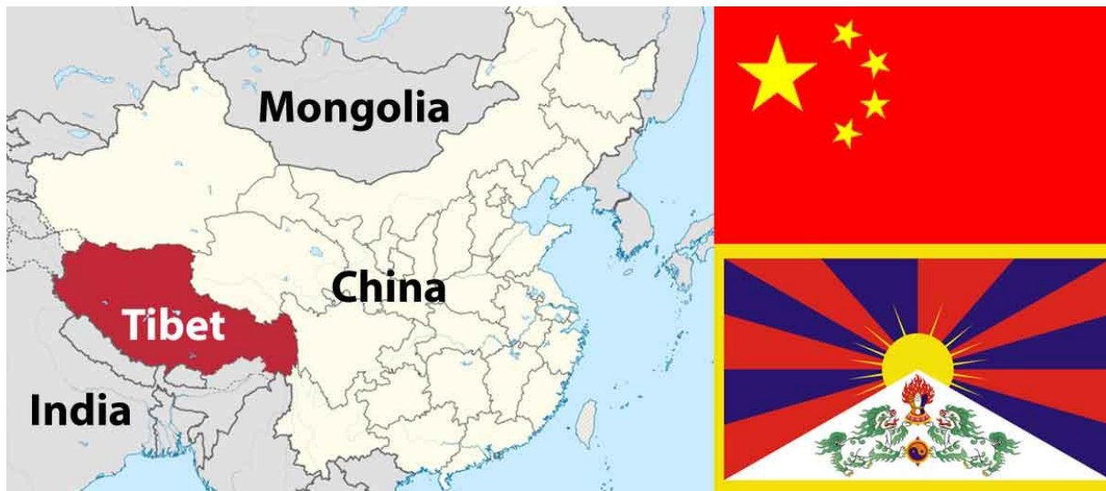
Map showing Tibet's location | China flag (top) & Tibet (below)

increasing Chinese rule but the uprising was crushed by the Chinese army and thousands died. As the natural leader of the country, the Dalai Lama had to flee Tibet and he and a large number of his followers went over the border to India. They were welcomed by Indian leaders and the refugees created a society that respected the language, culture and religion of Tibet.