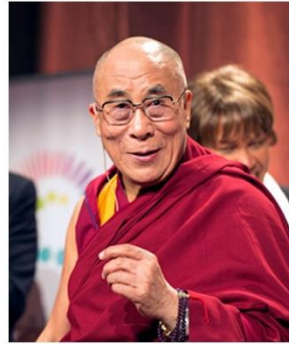
Dalai Lama receives Nobel Peace Prize

Here are some more interesting facts about him: