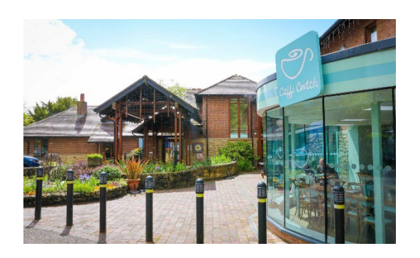
Nightingale House Hospice