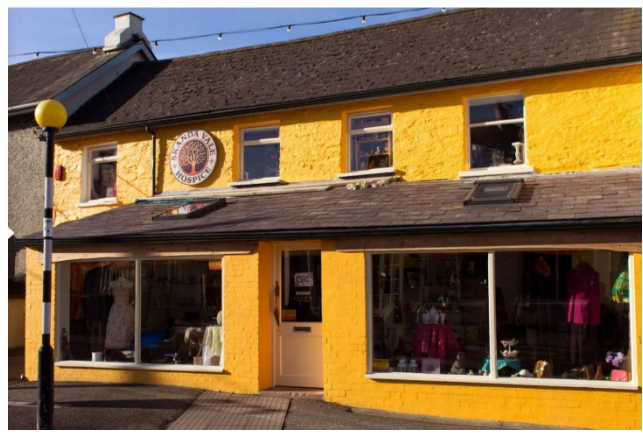
Skanda Vale Hospice

In the hospice near Llandysul, there is an emphasis on a person's mental, emotional and spiritual elements - without forgetting about the physical elements. There is a great emphasis on tailoring the care according to the individual's wishes and needs. At Skanda Vale, individuals with the skills and the time come together to provide free care to the patient and a break for the family. To help with fund-raising, there is a shop in the town of Newcastle Emlyn.