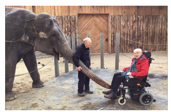
Skanda Vale Hospice

auspices of The Community of the Many Names of God. Accommodation and a hospice were also added to the area.