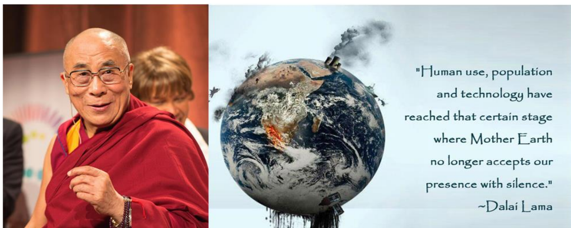
The Dalai Lama

Here are a few points that reflect Buddhist views today about the role of humanity as stewards.